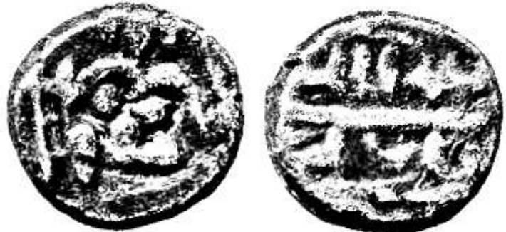
Copper, 1.65 g, 12x11 mm

I would also like to add another coin which is bought from same dealer and also hails from Tamilnadu. This coin has a crude figure of a seated goddess with ladder-like object in her left hand on obverse and Nāgari legend 'Mahā/rāja' in two lines on reverse, which it is similar to a variety published by Ganesh 3 (3.20 g) and Maheshwari and Wiggins 4 (3.00 g & 3.50 g). But my coin is lighter in weight and the crude image with slight deviation in the portrayal of goddess suggests it as different variety.