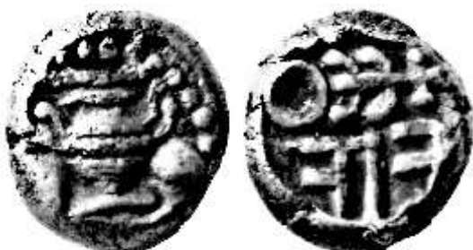
Copper, 2.75 g, 12 x11 mm