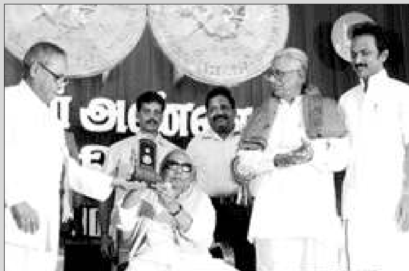
Hon. Union Finance Minister, Shri Pranab Mukherjee presents the Commemorative Coin set of the late Shri C. N. Annadura to CM of Tamil Nadu, Shri M. Karunanidhi.