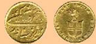
Lot # 201

Gold, 3.8 g, Rupees 5 or 1/3 Mohur, El Company arms with a lion holding the crown on obv., without Date, issue of 1820 (KM 422). Certified by NGS as XF 40, Rare.