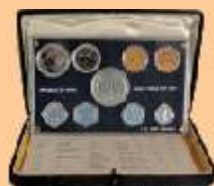
Lot # 308

VIP Proof Coin Set, 1971, Set of 9 coins from 10 Rupees to 1 Paise, Food For All Series, Bombay mint, B mint mark, packed in acrylic case and boxed in Blue Velvet Box with the golden Mint Logo on top (RB# 30). Mint State and Extremely Rare.