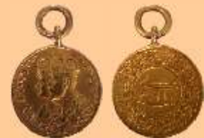
Lot # 334

Delhi Durbar Medal 1911, George V, Gold, 6.08 g, Miniature Medal, conjoined busts of George V and Queen Mary to left in a floral wreath on obv., Persian Chronogram in the outer margin on the rev reads,