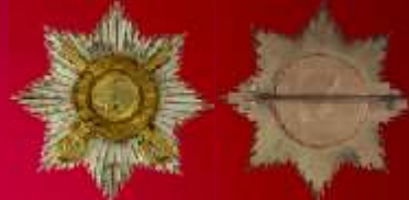
Lot No. 432 Estimate Rs. 15,000 Sold for Rs. 22,000