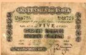
Lot # 345

Victoria Empress, 5 Rupees, Green Underprint, Signed by A. F. Cox, issued from the dual circles of Lahore or Calcutta, on 24 Feb 1898 (Jhun# 1.1D.4). Type 1.1D, Prefix EA12, usual joints at the back, complete note with minor holes, Very Fine for the type, Extremely Rare.