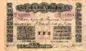
Lot # 348

Edward VII, 10 Rupees, Red Underprint, Signed by R.W. Gillen, issued from the single circle of Rangoon (R near the language Panels), on 11 Oct.