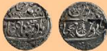
Lot # 177

Machhalipatan (Kankurti) mint, Silver, Rupee, in the name of Muhammad Shah, minted divided with Machhali in the second line and patan in the bottom line on rev with an upside down palm tree in the seen of julus on rev.