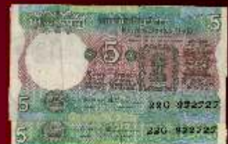
Lot No. 441 Estimate Rs. 3,000 Sold for Rs. 50,500