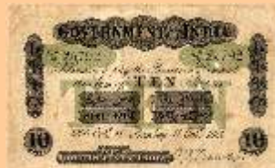
Lot # 346

Victoria Empress, 10 Rupees, Green Underprint, Signed by O.T. Barrow, issued from the single circle of Bombay, on 11 Oct. 1900 (Jhun# 2.1D.4). Type 2.1D, Prefix CA75, Single note without any joints, minor holes, Very Fine+ for the type, Extremely Rare.