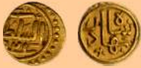
Lot # 41

Bahadur Shah (AD 1526-1537), Gold, 2.29 g, 1/3 Tanka, AH 941, Bahadur Shah on obv, as-Sultan Sanah and date on rev (Rajgor# 2331; G&G# G340). Extremely Fine, rated RRR by Goron & Goenka, Extremely Rare.