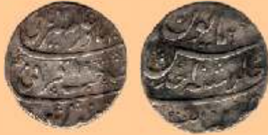
Lot # 67

Shah Alam I, Silver, Rupee, Khambayat mint, Shah Alam I named as Bahadur Shah, the Second Alamgir. The Persian couplet reads, " sikkah zad chu sahib qirani / Bahadur Shah Alamgir Sani " = Struck coin like the Sahib-i-Qiran;