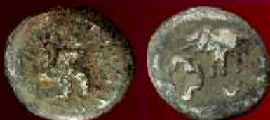
Lot No. 1 Estimate Rs. 1,200 Sold for Rs. 11,000