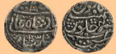
Lot # 146

Ram Singh (AD 1749-51, 1753-1772), Sojat mint, Silver, 11.02 g, Rupee, in the name of Alamgir II, complete mint name at bottom on rev, RY 4 (= AD 1757), decorated fields, dotted Plus symbol as mint mark on obv (Lingen# S.02.02).