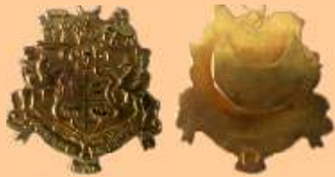
Lot # 163

Kutch State Cap Badge, Gold, 6.150 g, Coat of Arms of the Kutch State with a mount at the back for mounting on a Cap of a Royal Army Officer of the State. Almost UNC, First Known piece of such a highest order.