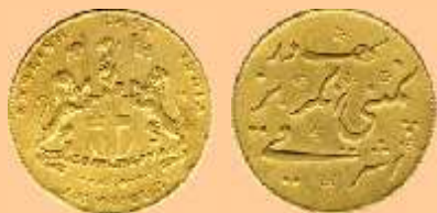
Lot # 202

Mohur (Ashrafi), Gold, 11.7 g, 1819 issue, Arms of arms of the East India Company on obv., Persian legend on rev., ND, milled edge (KM 421.1). Certified by NGS as VF 25, Rare.