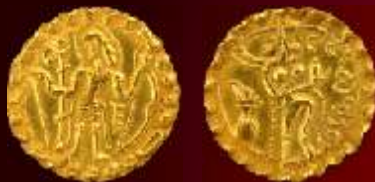
Lot No. 12 Estimate Rs. 1,75,000 Sold for Rs. 1,75,000