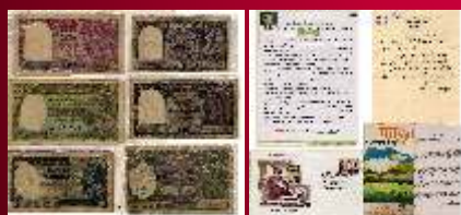
Lot No. 325 Estimate Rs. 8,000 Sold for Rs. 33,000