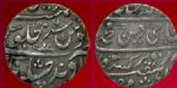
Lot No. 122 Estimate Rs. 90,000 Sold for Rs. 1,30,000