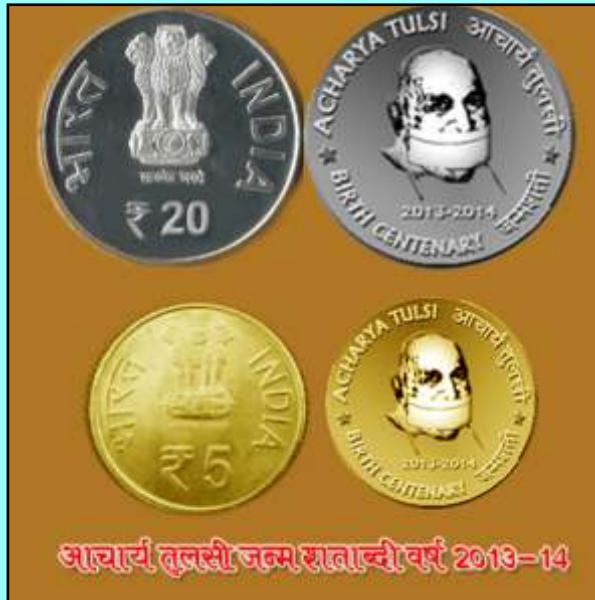
आचार्य तुलसी जन्म शताब्दी वर्ष 2013-14