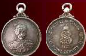
Lot No. 323 Estimate Rs. 4,000 Sold for Rs. 42,000

Tel: +91-22-23820 647 | Cell: +91-9594 647 647 | Tel: +91-22-2366 3148 +91-22-3079 3148 | QBC 3148 | Fax: +91-22-23870 647 | info@rajgors.com www.Rajgors.com