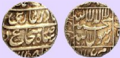
Fig3: Coin of Shuja from Akbarnagar mint in his own name dated RY Ahd/ AH 1067 with additional ʿ to the left of his name on obv. , may be to emphasize the last syllable in his name.

Bengal put his own initials on the coins emanating from his capital. And he continued this tradition till he issued coins in his own name with an additional ʿ ( fig 3 and fig 4)