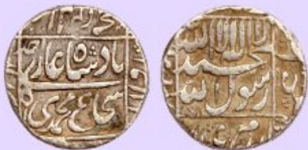
Fig 4. Similar to above, but Obv. without the Square .