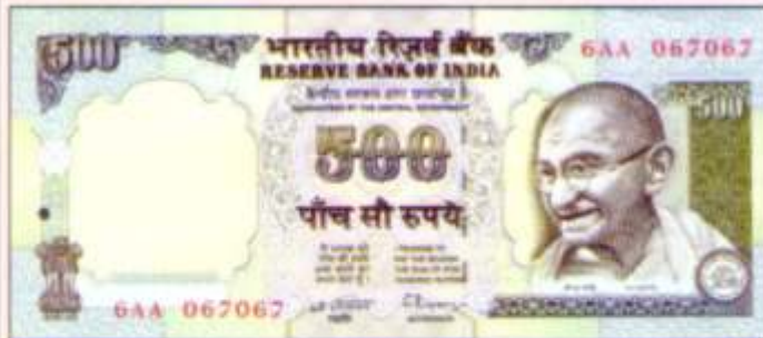
Rs.500 – Signatory Governor Mr. Rangarajan; "M. K. Gandhi" written below Portrait

The exercise cost the exchequer around $ 95 million.