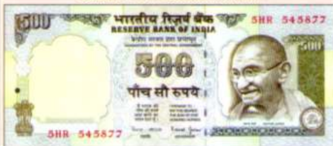
Rs.500 – Signatory Governor Mr. Bimal Jalan; "Mahatma Gandhi" written below Portrait