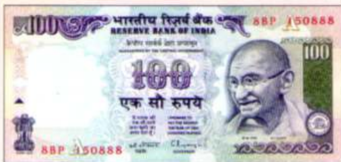
Rs.100 – Signatory Governor Mr. Rangarajan; "M. K. Gandhi" written below Portrait