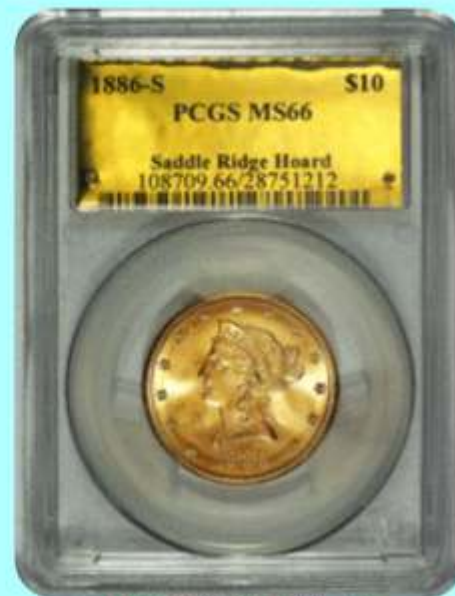
1886-S $10 PCGS slab