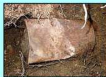
Rusted can of gold coins as found at discovery site in February 2013

The owners of the property discovered the trove while they were walking their dog on their property. Although they had reportedly hiked the trail numerous times previously, it was not until they spotted a rust-covered metal can poking out of the ground that they chose to explore further.