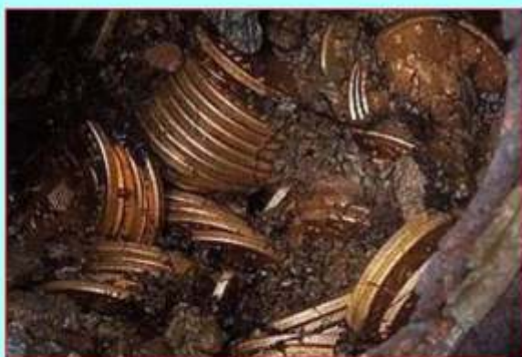
The Gold coins shown as found