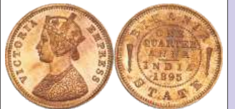
Bikaner State, Victoria Empress, 1895, 1/4 Anna, Red, Copper