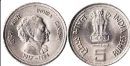
India, 5 Rupees UNC, 1985, Indira Gandhi, Mumbai Mint