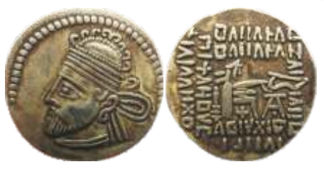
Persia, Parthian Empire, Gotarzes I, King (96-91 BC), Drachm Sliver