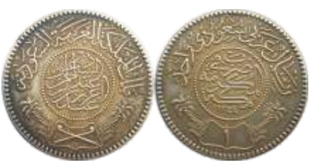
Saudi Arabia, AH 1354 AD 1935, KM# 18. 1 Riyal, 1917 Silver Plated Copper