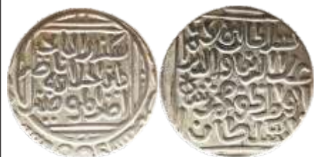
Delhi Sultanate, Muhammad Shah II Khilji (1296-1316), Silver plated, Tanka, Delhi mint, UNC