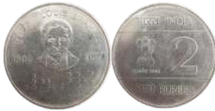
Republic of India, 2 Rupees, 2009, Louis Braille, Steel