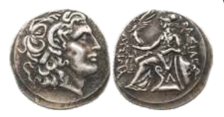
Macedonia, Alexander III, the Great c. 336-323 BC, Silver, Drachm