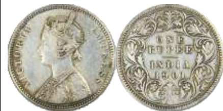
British India, Victoria Empress, Rupee, Silver, 1901