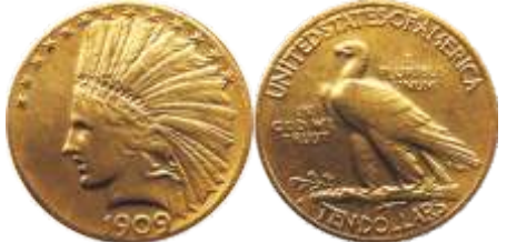
USA, Gold-plated, 1909 S, 10 Dollars, Gold plated, Indian Half Eagle