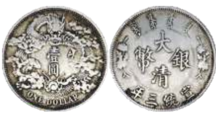
China, Dollar, silver-plated copper, Qian Longyang yuan