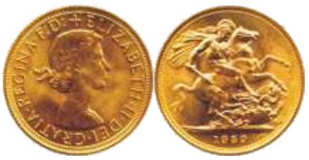
UK, British Sovereign, Elizabeth II, 1952, Gold-plated-Guinea coin