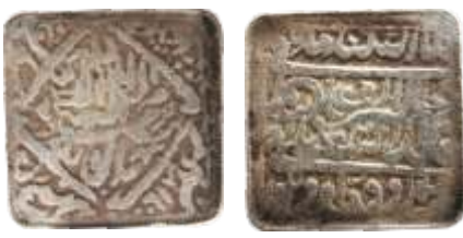
Mughals, Akbar, Silver Urdu Zafar Qarin Mint, AH Alif (1000)