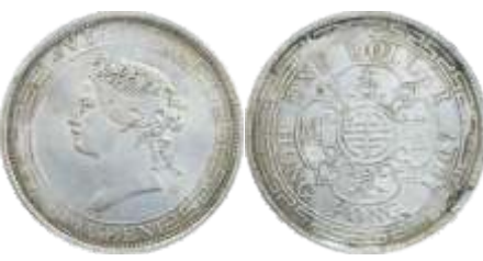
Hong Kong, Victory Queen, 1 Dollar, Silver plated Brass, 1867