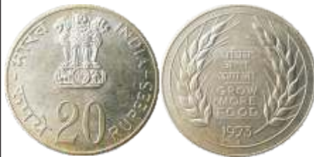
Republic of India, 20 Rupees Proof, 1973, Grow More Food, Silver-Plated Nickel, B mint mark