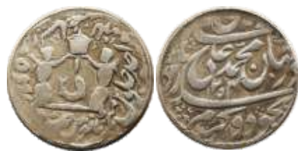
Awadh State, Muhammad Ali, 1 Rupee, 1254, Lucknow Mint