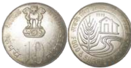
Republic of India, 10 Rupees, 1978, Food and Shelter for All, Silver plated Nickel