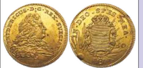
Sweden, Fredrik, I, 1750, HM, AV, Dukat, East Indian, Gold plated Brass