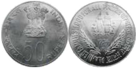
Republic of India, 50 Rupees Proof, Planned Families: Food For All, 1974, Silver plated Nickel