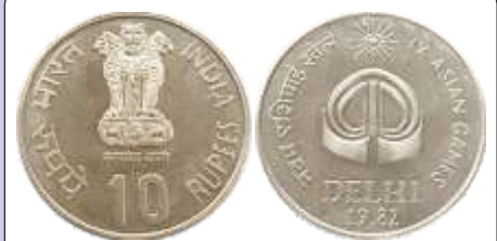
Republic of India, 10 Rupees UNC, 1982, Asian Games, Delhi, Brass-Nickel Plated, Mumbai mint