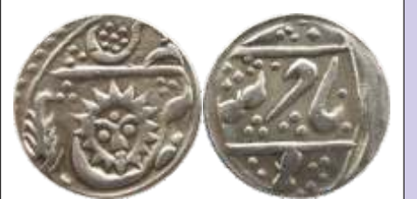
Princely State of Indore, Silver, Rupee, small Sun type