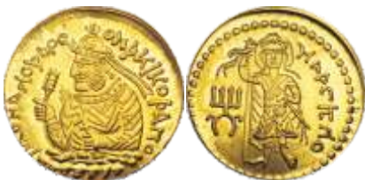
Kushan Empire, Huvishka (AD 152-192), Gold plated Brass, Dinar, Boddo (Buddha) type

It is alarming to see dozens of rare and scarce coins of India of all periods are being forged in China and sold over the Internet. Although these are sold as Replica or New or Copy at the First-Point-of-Sale, but what will happen when the successive buyers will sell these coins as genuine to novice buyers and new collectors? At this rate, our hobby of Coin Collecting will be killed soon. We must spread the news about these fake coins.