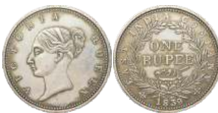
British India, Victoria Queen, Rupee, East India Company, 1839, Silver plated Brass, Indian Head