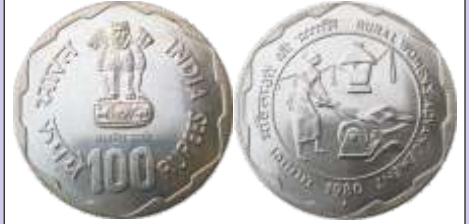
Republic of India, 100 Rupees, Silver plated Nickel, 1980, Rural Women's Advancement