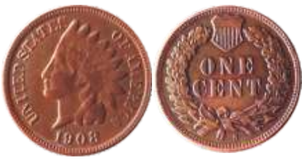
USA, 1 Cent, Indian Head Cent, 1908 S Copper